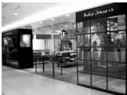
The new concept store in Tokyo's Shinjuku area