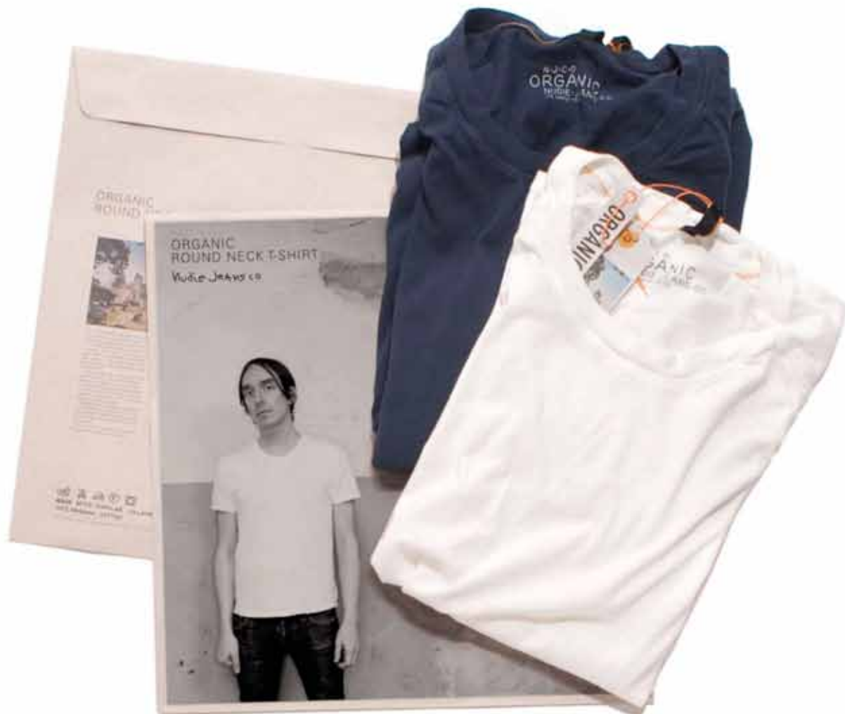
Some of the garments in Nudie Jeans' new Backbone program.